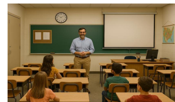
(a) A student (b) A teacher desk (c) A student desk