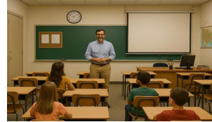
(a) A student (b) A map (c) The teacher