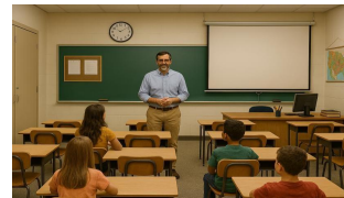
(a) A teacher desk (b) A blackboard (c) A screen