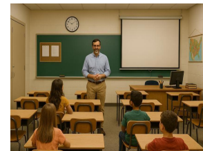
(a) A student (b) The blackboard (c) The teacher