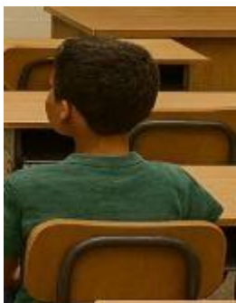
Image 3: Who is he?